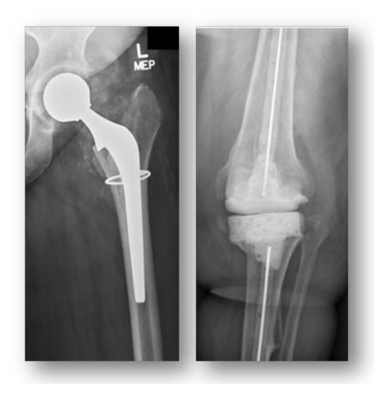
Examples of antibiotic cement spacers: Hip (left) and Knee (right)

Most patients with an infected joint replacement are able to undergo the second stage of the revision surgery, but unfortunately there are some patients who are too sick or have been diagnosed with a difficult to treat bacteria/yeast that limits their abilities to undergo the second stage surgery. Lastly, the mortality (chance of dying) of an infected joint replacement has been found to be higher than some common cancers at 5-years, highlighting the importance of proper identification and management of an infected joint replacement.